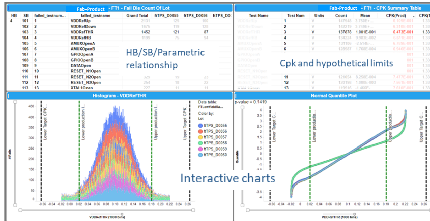
Figure 1: Link Hard Bin to Soft Bin to Parametric Test Data. Calculate CPK with actual and hypothetical limits. Interactive charts.

Quickly and seamlessly visualize all your data